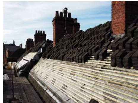
Re-roofing October 2011

There has also been considerable demolition work at the rear of the site, with the removal of the operating theatres, and other additions, many dating from the 1980's. This has obviously resulted in some temporary gaps in the original brickwork, but has had the immediate advantage of opening up the rear of the site, and allowing more light in to both the rear of the building, and what will be the courtyard gardens. When work is completed the rear elevation will once again, to all intents and purposes, look as Walter Brierley originally intended it.