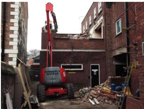
Rear Elevation November 2011

There has also been considerable demolition work at the rear of the site, with the removal of the operating theatres, and other additions, many dating from the 1980's. This has obviously resulted in some temporary gaps in the original brickwork, but has had the immediate advantage of opening up the rear of the site, and allowing more light in to both the rear of the building, and what will be the courtyard gardens. When work is completed the rear elevation will once again, to all intents and purposes, look as Walter Brierley originally intended it.