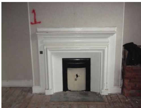
An original fireplace surround

Less apparent to the casual passer-by has been the extensive work going on inside the building. This has included stripping out the plant rooms, lifts, suspended ceilings and stud walls...in essence taking the building back to its original layout and proportions, and at the same time uncovering many of the handsome and elegant features that Brierley designed, but which have remained unseen for so many years. We arranged for members of The York Civic Trust to visit the site in November, thus giving them the opportunity to see the work at closer quarters, and view for themselves some of the features that are being revealed as the renovation and refurbishment of this unique building progresses.