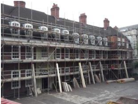
Front Elevation October 2011

Since the last Newsletter which was issued in mid-September, work on site started in earnest and on schedule in early October. Those visiting the centre of York may have noticed the frantic activity levels since! The south western end of the site was cleared to facilitate the installation of the site offices, and the scaffolding went up on the front elevation. The Brierley building has now been re-roofed, and where possible the original rosemary tiles have been salvaged and re-used, thus helping to retain the mellow appearance of this handsome period building.