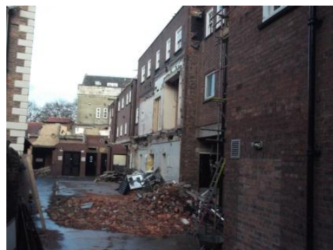
Rear Elevation December 2011